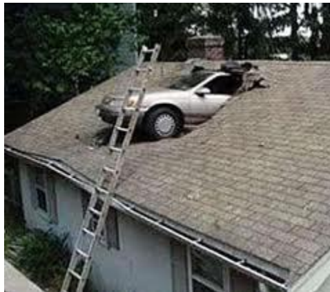
It's a safe bet Carfax caught this one.

Carfax reports what insurance companies and the Department of Transportation report, along with a host of about 34,000 other sources. Despite this crazy number of sources, previously repaired damage or other issues many times evade their wide radar.