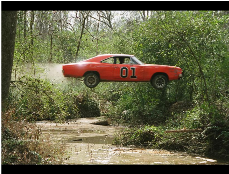
Your Mechanic: "Where did she go to church again?"

church on Sundays, and left it in her garage the rest of the week? Why, that would be a total waste of time! Well, if your mechanic had, he might have discovered something.