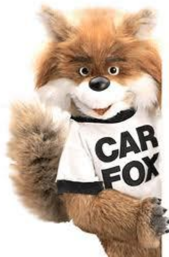
Touch me and I'm calling PETA.