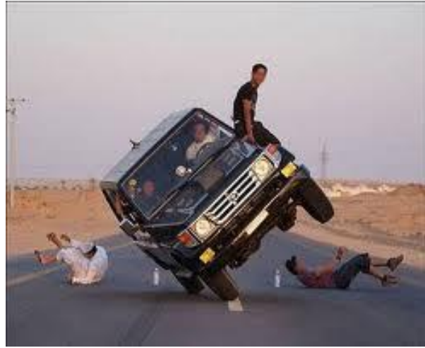
This qualifies as "interesting."

So don't blame the Car Fox if he does not find every problem with your vehicle. Your mechanic is going to be the best source of history for that vehicle. If it was ridden hard and put away wet, he'll know better than the Car Fox. Or you can just buy off of us. We have been in the business for over 35 years, and know what we're doing. You want a Carfax Report, you got it! We provide one for your viewing with every late model vehicle. You want your mechanic to inspect a vehicle we have on the lot? No problem! Buy with confidence at Log Cabin Motors today!